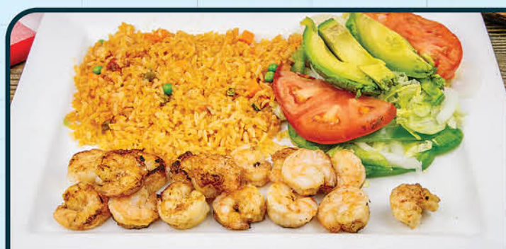
Camarones al Mojo de Ajo