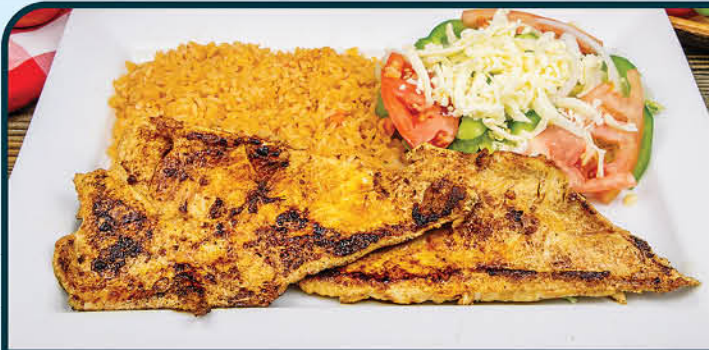
Grilled Chicken Breast