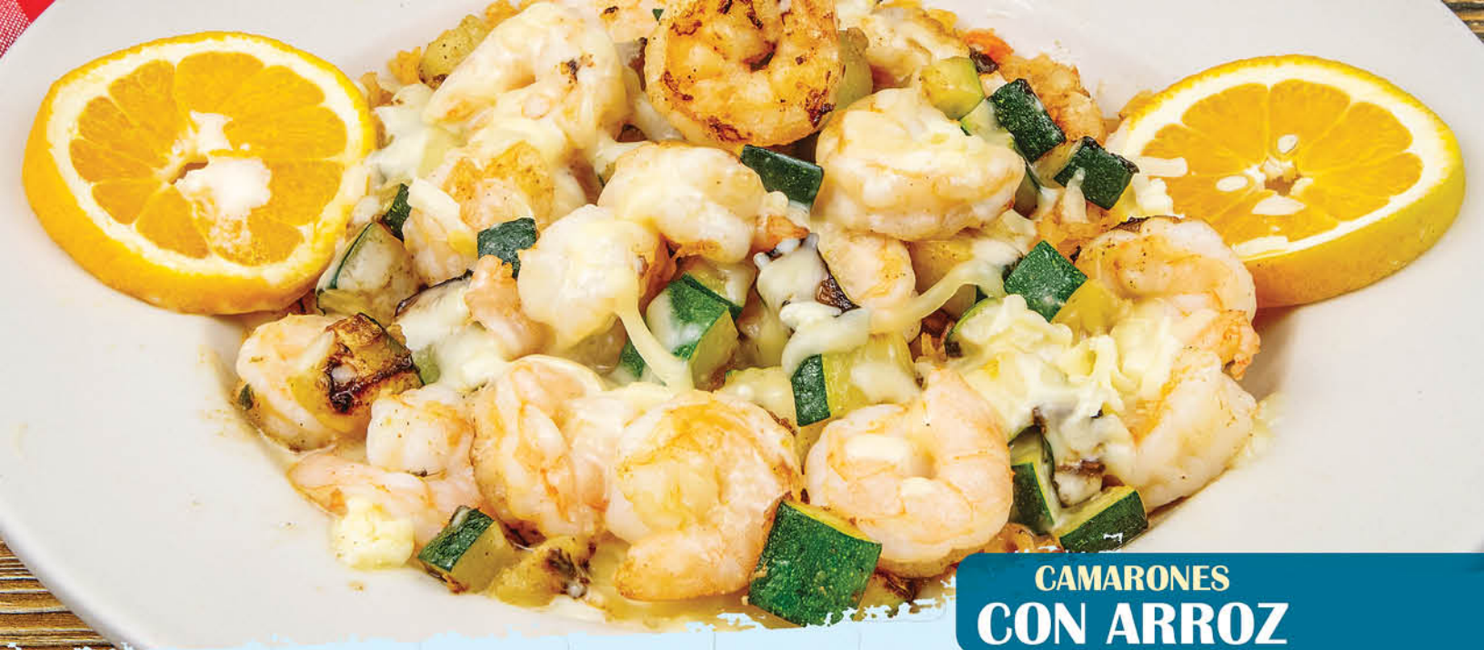
CAMARONES CON ARROZ