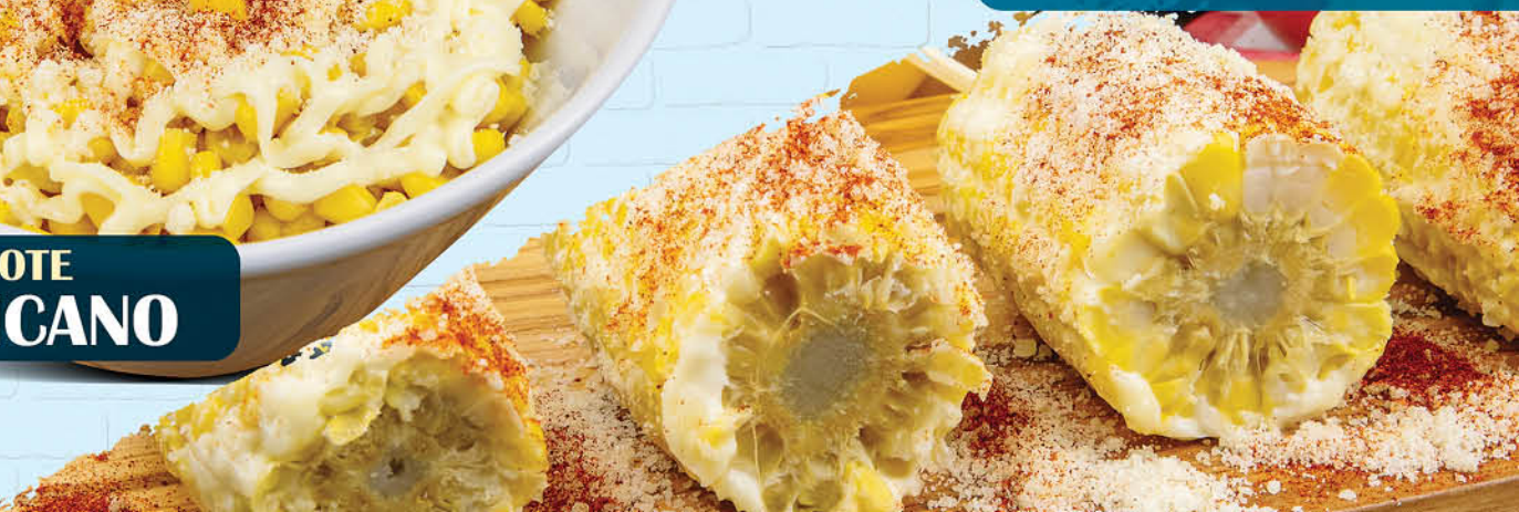
FIESTA STREET CORN