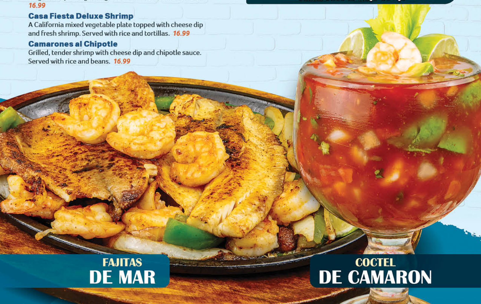
FAJITAS DE MAR