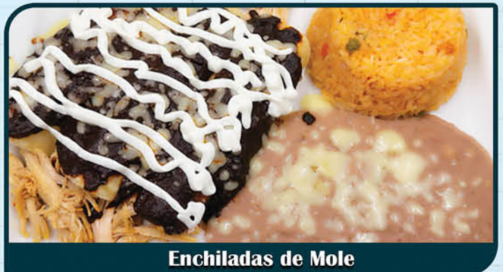
Enchiladas de Mole