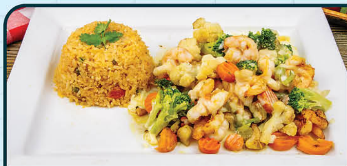
Casa Fiesta Deluxe Shrimp

Grilled, tender shrimp with cheese dip and chipotle sauce. Served with rice and beans. 16.99